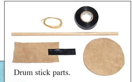
Drum stick parts.