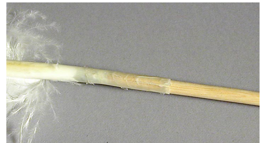
Insert the dowel into the quill shaft.